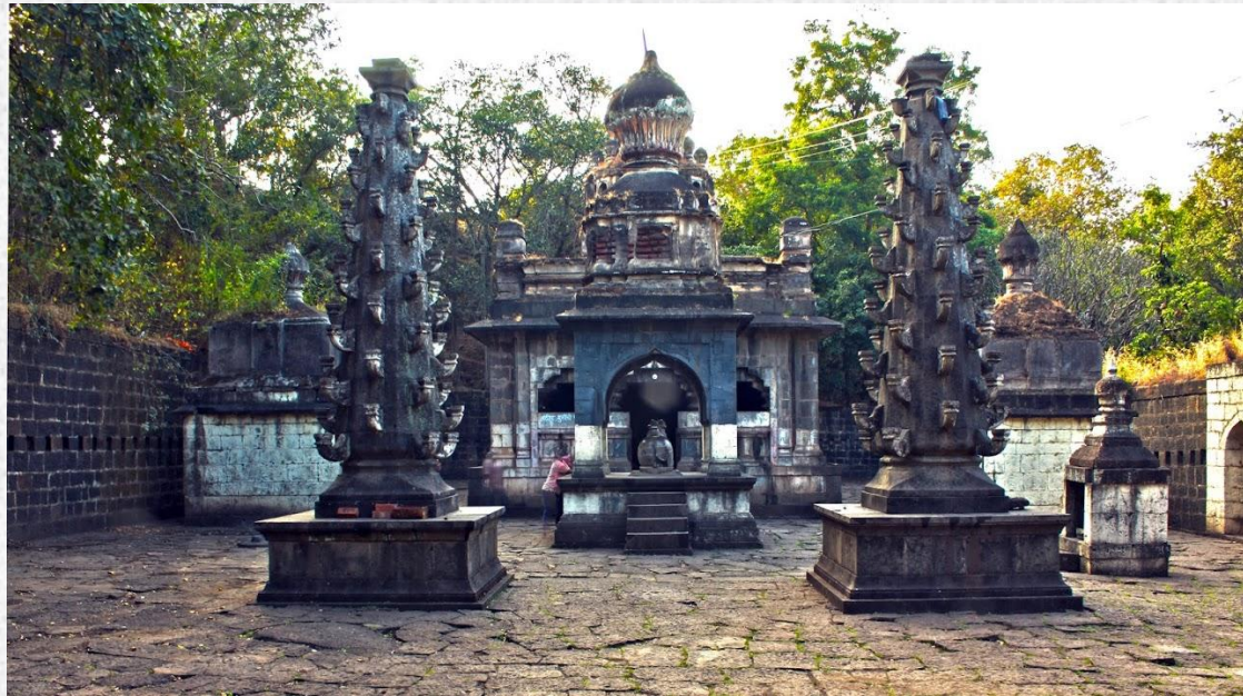
MASA funded research 2018 by Vaidehi Lavand & Saili Palande Datar

About Pateshwar Heritage Complex: Pateshwar is a unique and significant heritage site located 16 Km away from the city of Satara in Maharashtra. The site offers incredible visual experience to the visitors and fills their mind with intrigue and awe. The remote location of the site adds to the mystic and it leaves audience in sense of awe, respect and intrigue. It is hence important to explore the secrets of Pateshwar through scientific enquiry and faculty of various subjects. This exercise aims to underline the importance of the small but unique site of Pateshwar in context of India heritage & history and has immense bearing on Satara region's multifaceted cultural identity. Dr. Vaidehi Lavand and Ms. Saili Palande Datar are currently working on MASA funded research project to document this site.