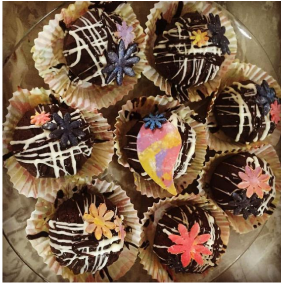
Cup cakes prepared by Tanvi Shah